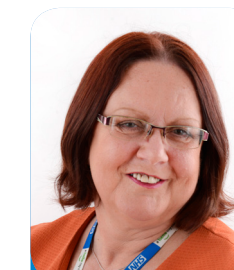
Until October 2020