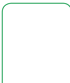
Keiron Timmins (awaiting photo)