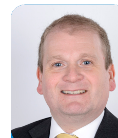
Until October 2020