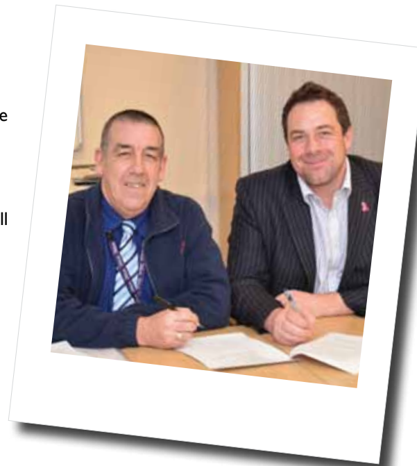
Members of staff can view the agreement on the Partnership Forum section of the Intranet (under 'P' on the A to Z).

"...delivery of high quality health care services."